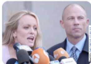
↑ Stormy Daniels and Michael Avenatti in 2018.